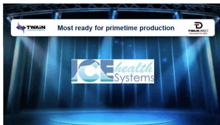
ICE Health Systems - TWAIN Direct Developers Day award winner for "Most ready for primetime production"

A highlight from the event was the TWAIN Direct ISV Showcase and Awards segment. At TWG we have spent a lot of time and effort to develop the TWAIN Direct RESTful API specification and it was so gratifying to see all the amazing creativity and innovation on display during the showcase!