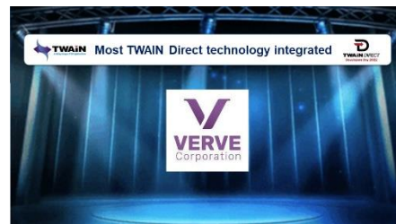
Verve Corporation - TWAIN Direct Developers Day award winner for "Most TWAIN Direct technology integrated"

The event also featured a Business Track - roundtable discussions on a number of industry topics. The attendees found these sessions thought-provoking, and left the day with actionable information they can apply to their businesses. Additionally, the evening reception provided a great opportunity for further networking and business planning.